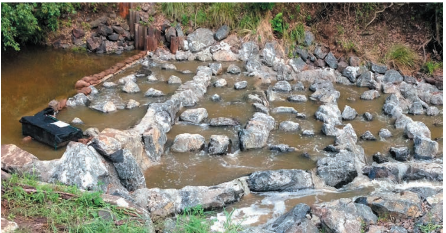
Bremer River Rock Ramp Fishway, South East Queensland