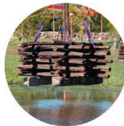
Log fish hotel, Gooseponds, Mackay