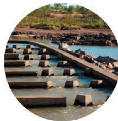
Concrete cone fishway, Flinders River, Gulf of Carpentaria