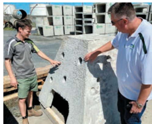
Prototype 'Pyramid' reef module showing surface roughness and juvenile fish habitat

Utilising extensive backgrounds in government regulatory processes to ensure compliance