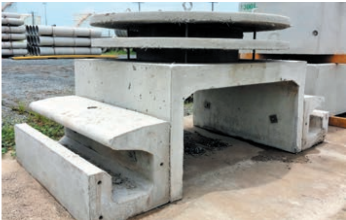
Prototype 'Ledge and Cave' Habitat Reef module

Utilising existing contacts in regional and stakeholder networks to provide knowledge transfers and training